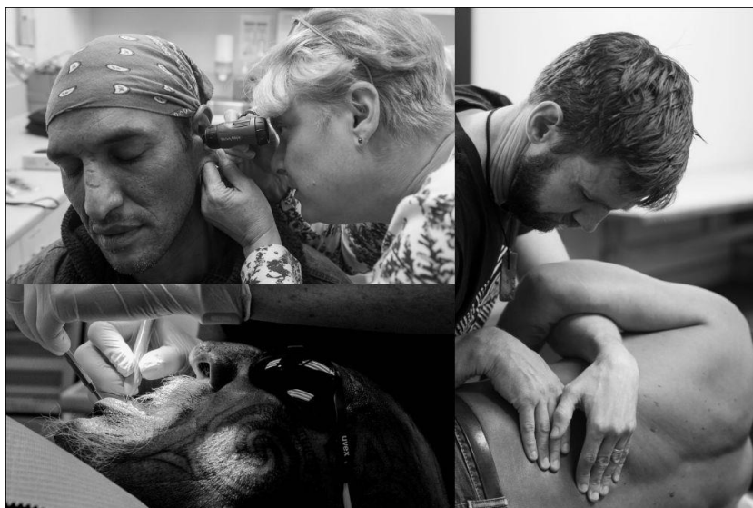
Images from DCM's 50th anniversary photo exhibition – Our 50th anniversary was in 2019, but since then two out of the three whānau pictured in these images have passed away.

Meanwhile, a large new study links loneliness or social isolation to a higher risk of an early death. People who experienced social isolation had a 32% higher risk of dying early from any cause compared with those who weren't socially isolated. Participants who reported feeling lonely were 14% more likely to die early than those who did not.