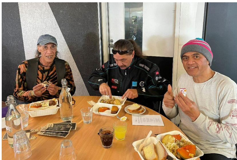
Our Seasonal Kai for Matariki provided whānau with an opportunity to take part in an enjoyable event that has become a highlight of the year.

Whānau can be left without a sense of place when they experience homelessness. When all of your time is spent looking for shelter or searching for food, a sense of belonging and safety is not attainable. At DCM we aim to foster an environment that welcomes whānau and helps them to feel as if they have a place where they belong.