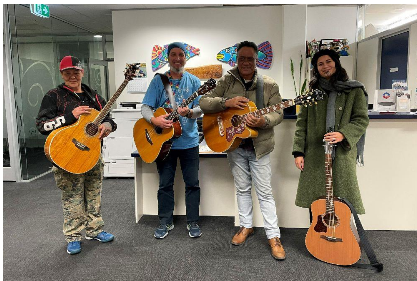
DCM has been able to purchase four new guitars for use at waiata thanks to support from the Nikau Foundation.